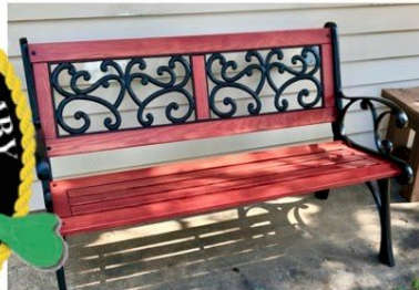
Service project for Good News UMC. How can you help your Chartered Org?