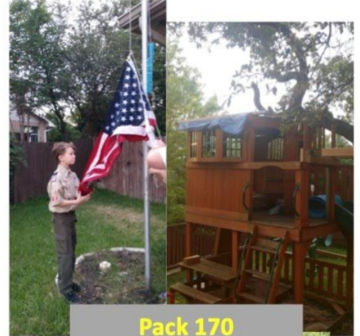
Pack 170 #ScoutingAtHome

See more here: CBS Austin - TAPS ACROSS AMERICA