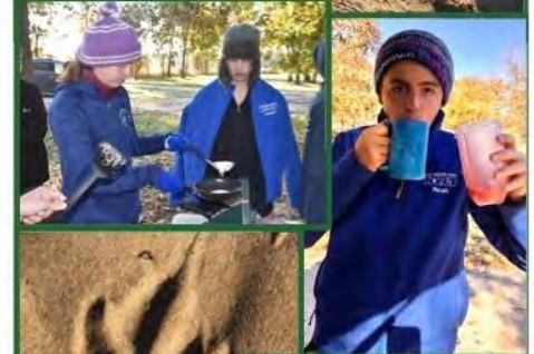
Troops 258 & 358 at a Bamboo Farm near Buckholts, TX