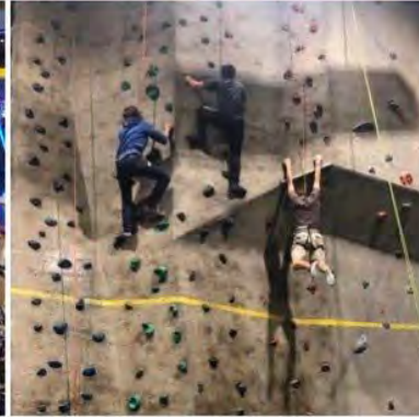
Crew 158 at Shafer Bend Recreation Area (LCRA)